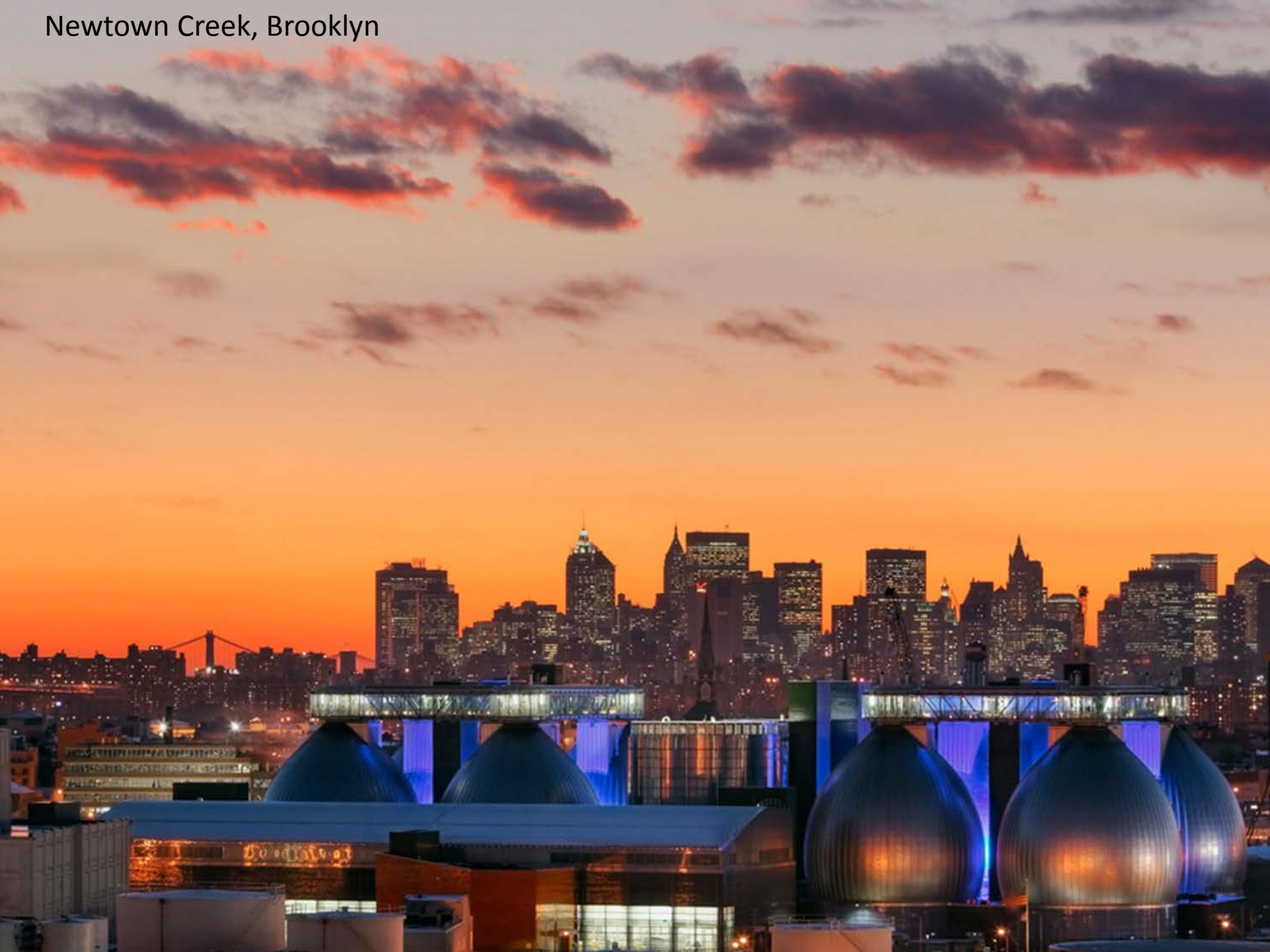
Newtown Creek, Brooklyn